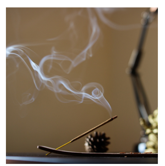
GENESIS 37:1-4, 12-28

What do we do when our sacred scriptures depict our "Protector" placing some people under peril? How can we reconcile our belief in one who appears to stand by while we are thrust into jeopardy? In moments when we feel as though we're being engulfed by stormy seas, crying out for grace and finding none, how must we respond? It's time to face the understanding that neither God nor Her cosmos are obligated to grant us continuous comfort or even personal security. These natural laws might restore equilibrium, but they can also cause imbalances leading us to disaster. Can we not passionately cry out to God to treat us justly? Or is it time to seek wisdom from our spiritual predecessors, taking control through our own divine agency? The answers to these questions may challenge our faith, but it is a challenge we must meet, embracing the complex truths within our beliefs.