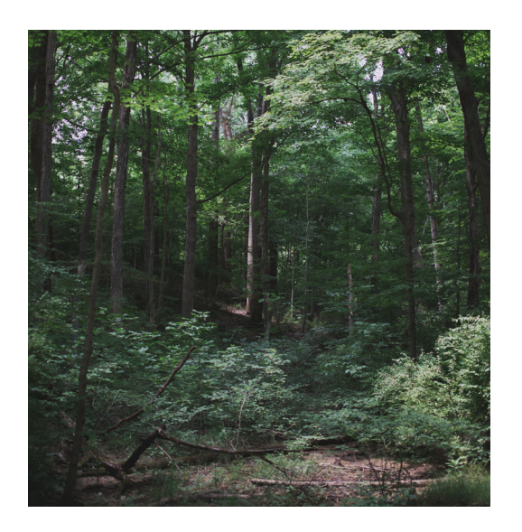
ROMANS 8:26-28, 31, 35-39

Our Creator keeps Her word to keep us in her impenetrable love. She hears our needs and does not try to bargain or cheat us out of abundance. She gives to us freely as she knows all that has tried to pull us from Her. Even as the terrors of this life obscure Her from our view, her love comes running to preserve us in the most trying hours. She knows that we are beyond value regardless of what price tag evil systems may have been affixed to us.