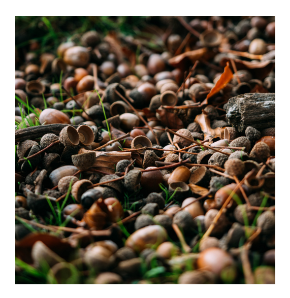
MATTHEW 13:1-9, 18-23

I appreciate how the narrative of the seed in this parable progresses, from falling on a path to its growth stages.