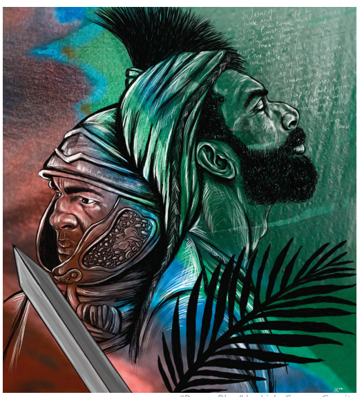
"Power Play" by Lisle Gwynn Garrit