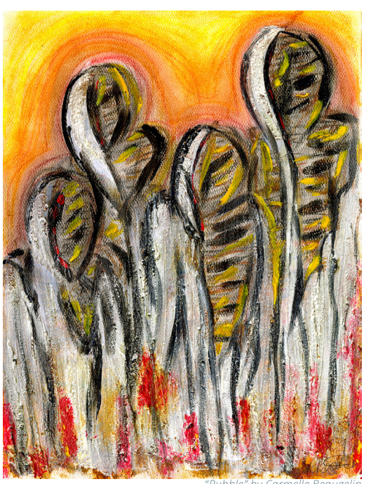
'Rubble" by Carmelle Beauge