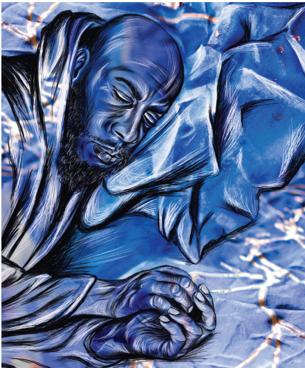
by Rev. Lisle Gwynn Garrity

A kaleidoscope doesn't expose your eye to anything that isn't there. It takes what is in view, and with light and mirrors, creates a new, dynamic, luminous image.